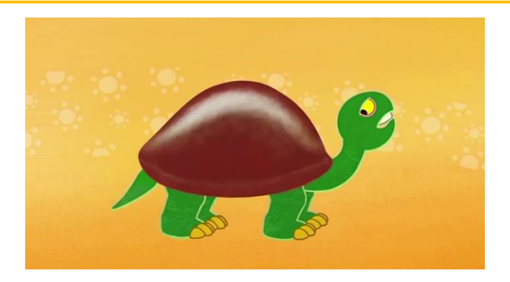
FIGURE 10: Tortoise's unbroken shell

The Tortoise at first is a likable and sociable character. He is also passionate and insistent. Maroon colour has been used to represent this intensity and passion. It has also been used to show his confidence in his interactions with other characters. We see his confidence in winning the races against Hare and his confidence in wanting to guide the birds to the heavens for a party despite not being familiar with the terrain. Nevertheless, his confidence makes the birds trust him and they gladly donate their feathers to enable him fly. Green has been used to amplify the lively character of Tortoise. He is easily likable and fresh. The character designer therefore captures the audience easily with this colour. To add on this, yellow colour has been used. Yellow is associated with happiness and joy just as portrayed throughout the story.