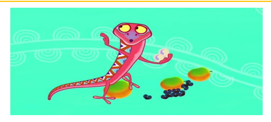
FIGURE 3: Lizard