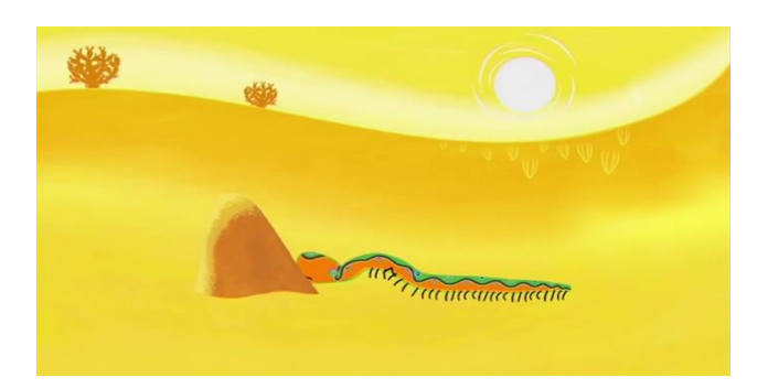
FIGURE 9: Snake

Snake as a character has been presented as a needy character that is always in need of assistance. He is blind and his wish is to get a pair of eyes so as to attend Tinga Tinga Festival . This vulnerability despite being seen through his actions and dialogue in the episode, 'Why Snake has no legs', the character designer has amplified this through the use of colour. The ordinary perception of snakes is that of a venomous and deadly animal, but the character designer has tried as much as possible to make the character (snake) likable to the audience (FIG 9).