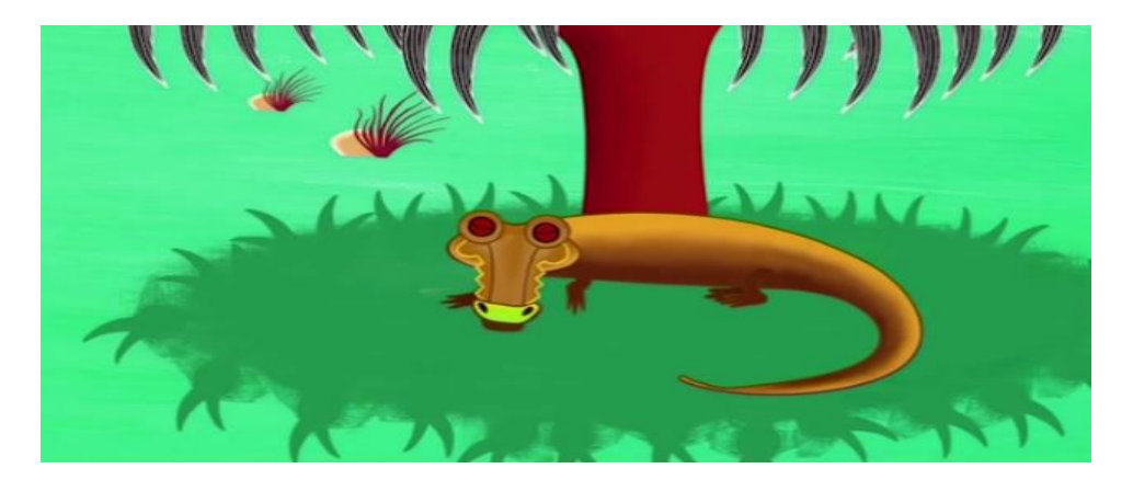
FIGURE 2: Crocodile