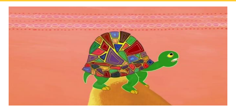
FIGURE 6: Tortoise