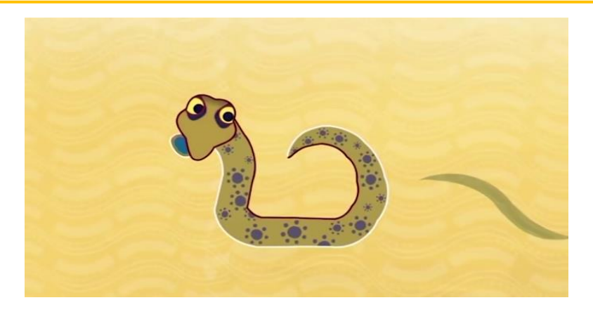
FIGURE 7: Puff adder's former color