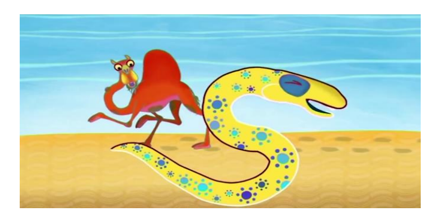
FIGURE 8: Puff adder's new color