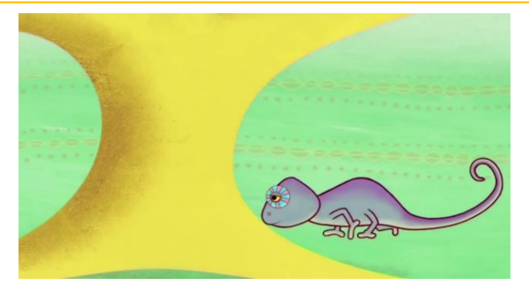
FIGURE 1: Chameleon