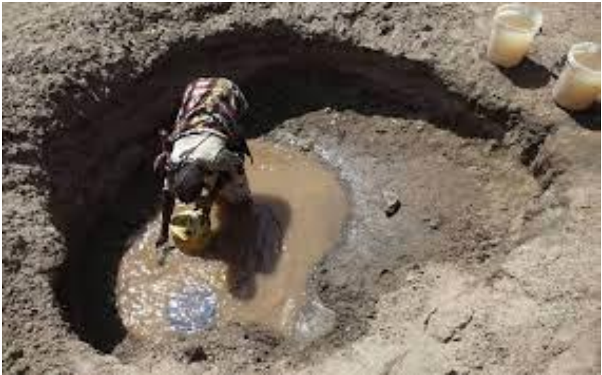
Photo File: A Resident of Kajiado County Fetching Muddy Water for Home Use