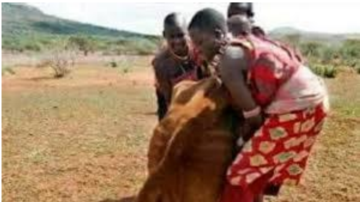
Photo File: Mass Livestock Loss from The Prolonged Drought in Kajiado

Climate change is expected to have a significant impact on pastoralists and sustainable development in developing nations (UN, 2007). While Patt and Schröter (2007) and Adger et al. (2009) reported that people's perception of climate risk, both individually and collectively, could influence the actions taken to mitigate the effects of climate change, Egeru (2016) reported the importance of having climate risk information to help shape those actions. When deciding whether to adopt an adaptation plan, perceptions of a danger to climate change appear to be more important than hazards related to the changes. Consequently, a community's perspective of climate change must be thoroughly understood in order to execute adaptation methods in an effective and suitable manner (Ernoul, Vareltzidou, Charpentier, & Muryanyi-Kovacs, 2020).