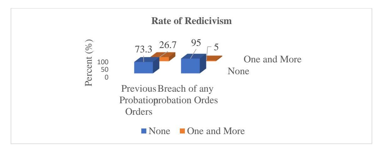
Figure 1: Rate of Recidivism

The findings in Figure 1 show that a significant majority of juvenile probationers (73.3%) have no previous probation orders, indicating a high prevalence of first-time offenders in the probation system. In contrast, 26.7% of juvenile probationers have received one or more prior probation orders. This smaller but notable group represents the probation system's recurring participants. In terms of violating probation conditions, the vast majority (95%) did not do so, indicating high compliance rates. In contrast, only 5% of juveniles violated their probation terms, indicating that a small percentage of juveniles who struggle to follow probation requirements.